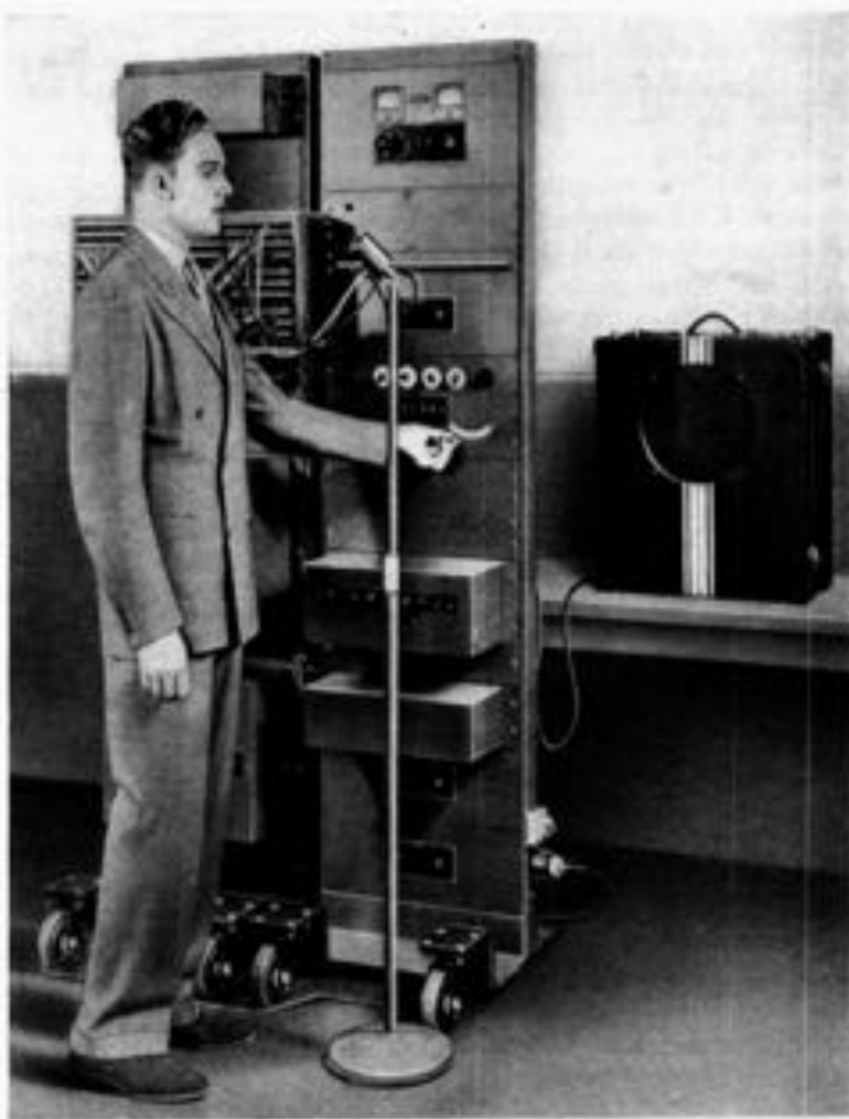
Fig. 4—The vocoder as demonstrated.